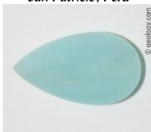
"Peruvian blue opal" San Patricio, Peru