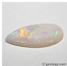
Coober Pedy, South Australia. White Opal