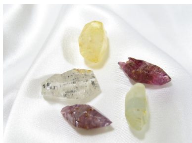
Sapphires (Corundum)

It's confusing. It's a riddle. It's a mystery. Now if this were a rock, then it may be a conundrum. But "conundrum" has an extra "n" and a shuffled spelling from "corundum", so let's press on with the correct spelling and intent.