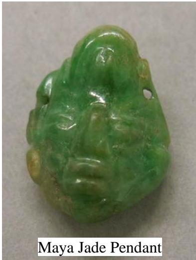
Maya Jade Pendant

The fact that jade was two different minerals was discovered in 1863 by French mineralogist Alex Damour. However, many of the Chinese artisans that worked the jade knew that there were two varieties. Their preference was for the harder jadeite when a selection was available. Because jade is beautiful and valuable, there are a lot of look-alikes but less expensive materials to take your money. Some of the most common are serpentine and green varieties of quartz including green quartz, aventurine, Prasiolite, and chrysoprase. Soapstone (talc) is often used to simulate jade figurines. Chalcedony has been used to simulate white (mutton fat and chicken brown) jade. It has also been used to simulate blue, green, and purple jade. These simulated jades should be easy to identify using hardness, fracture, and density. Glass has also been used to simulate jade but can be identified with a 10-power loupe to look for air bubbles in the glass. A buyer should also be aware that some jade is enhanced or “stabilized” by the use of resins and dyes. Some dealers will refer to the use of resin to improve the color and transparency of the jade as Type B jade. The use of dyes to enhance the color is sometimes called