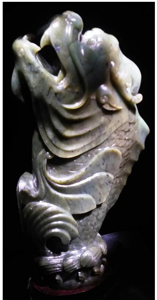
Jade vase carving of a Carp transforming into a Dragon. In ancient China, this symbolized successful completion of civil exams. Specimen on display at Perot Museum of Nature and Science.

Jadeite started its life as Albite, a Sodium Aluminum Silicate is often found as a matrix stone for other semi-precious minerals. During metamorphism, albite subjected to high temperatures and pressures breaks down into jadeite and quartz. Jadeite is also a Sodium Aluminum silicate but has a higher density than albite. It is an inosilicate with interlocking tetrahedra silicate chains. These interlocking tetrahedra silicate chains make jadeite a very tough mineral that resists fracture. Jadeite was often used for axes and hammers by the early stone-tool makers. With a Mohs hardness of 6.5-7.0, jadeite is slightly harder than nephrite. Jadeite ranges in color