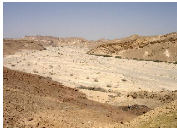
Wadi in Neveg, Israel

Now to me, a “wadi” sounds a lot like a gully or a shallow canyon. However, there is a difference. The “wadi” only has water intermittently – during the rainy season or following a thunderstorm. The water rushes down from a higher elevation and comes basically to a screeching halt as it encounters the dry, arid sands. The water is quickly absorbed causing the sediment to be dropped. The sediment is generally various types of rocks and sand. The rocks tend to be sharp and randomly shaped while the rocks of a river bed tend to be smoothed out over time. The rocks in the “wadi” do not get the slow erosion of the river – instead they are washed down and bang into previously deposited rocks, and then they bake in the sun for a year before the next episode.