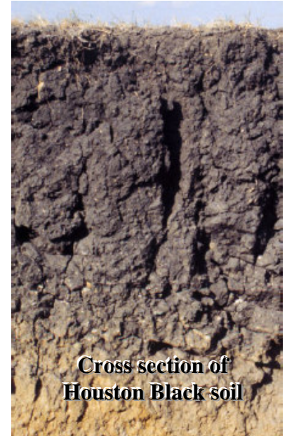
Cross section of Houston Black soil

Soil is made from decomposed rocks and humus, or organic matter. Soil is broken down into three basic types, those being clay, silt (or loam), or sand type soils. Clay soils are composed of the finest particles and is smooth when dry, sticky when wet. Sand soils are composed primarily of sand and feel rough. Silt is somewhere between clay and sand in particle size and feels smooth or powdery when dry and is not sticky when wet. Every state has a state soil, and twenty of the states (including Texas) have made the State Soil official by legislation. The State Soil for Texas is Houston Black. Houston Black is black, clay soil. Surprisingly, Houston Black soil is not found in the Houston area. Houston Black soil is found in a wedge from the Red River boarder near Bonham, through Dallas, Waco, Austin, and San Antonio with the thick portion of the web to the north. So now, we can put a name with the soil that, when wet, sticks to your boots and can add inches to your height as you try to dig in it. The Houston Black Soil covers about 2,000,000 (two million) acres. Some of the more important crops grown in the Houston Black soil are sorghum, cotton, and corn. It also supports a variety of native grasses for pasture land. Houston Black is noted for the degree of expansion and contraction as it varies from wet to dry. Here in Dallas we are all too aware of that expansion, it supports a thriving business in foundation repair.