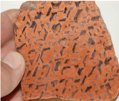
Graphic Granite from Burnet, TX

Now, let's move on to the Graphic part of the question. Graphic has many meanings. It can mean a clear or vivid picture (e.g. a graphic description of an earthquake). It can mean explicit (e.g. graphic violence). It can be a part of a computer that makes pictures or symbols on our displays (e.g. a graphic card). In mathematics, it can mean finding a solution by reading a value on a chart or graph rather than by performing a calculation. Finally, in geology, it means "having a texture formed by the intergrowth of certain minerals so as to resemble written characters". So Graphic Granite would be granite that has a surface resembling written characters.